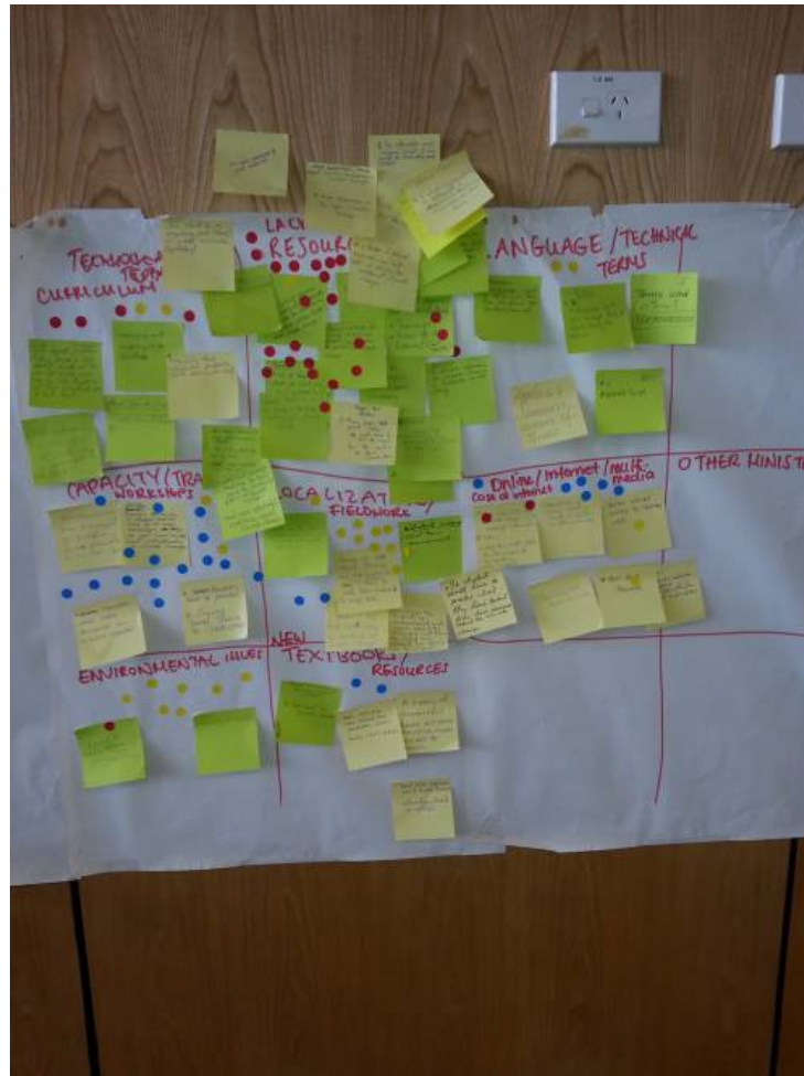
Plate 2. Clusters of prioritised issues and solutions from focus groups

validity and relevance for gauging community perceptions of the environment on small islands is demonstrated by Green (2005) . In this case, the participants were divided into small groups and given a stack of images that visually represented various aspects or elements of what could be perceived as climate change (for example, an image of a cyclone). These included a description written on the back, and additional blank cards could be drawn or written on by participants and added. The participants then placed the images on a grid along a continuum according to agreement with a statement, such as “I teach my students about this climate change issue” (teachers only) ( Plate 3 ). This was then discussed as a group and transcribed, as well as photographed. This was used to generate discussion, and not to produce quantitative data, as sometimes is the case in Q-sort applications.