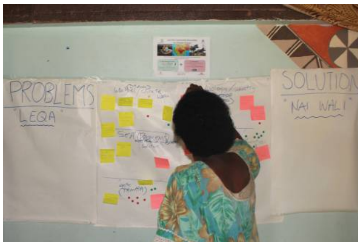
Plate 1. Problems and solutions identification exercise

3.2.1.2 Activity 2: Q-sort. Q-sort is a collective image sorting method of agreement with a statement, which is then used to prompt discussion (Palmer, 1983; Pitt and Sube, 1979). “Q-methods” were designed to be an objective method for the study of subjective values, opinions and meanings, in conjunction with other methods (Robbins and Krueger, 2000). Its